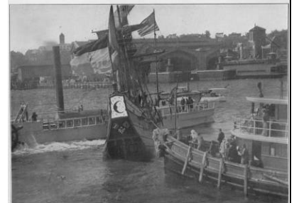
The Half Moon ramming the Clermont

On April 11, 1908 the Netherlands Hudson-Fulton Celebration Commission was formed under the patronage of His Royal Highness, Prince of the Netherlands, Duke of Mecklenburg and tasked with building a replica of the Half Moon.