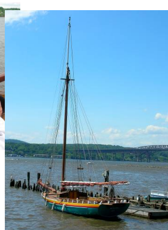
The Woody back home at the charging dock in Beacon( right)

"Never doubt that a small group of thoughtful, committed citizens can change the world. Indeed, it's the only thing that ever has."