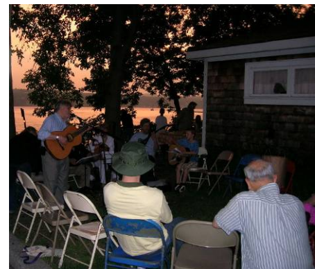
Great music and a great sunset after the meeting