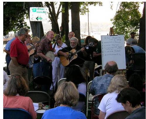
The first outdoor meeting of the year was kicked off with "Down by the Riverside"