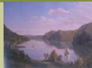
C. H. Moore, "Down the Hudson To West Point, 1861", courtesy of Frances Lehman Loeb Art Center, Vassar College

The seeds of American conservation were sown by many artists of the Hudson River School in the 19th century. Dr. Flad will review four 20th century examples where the Hudson River School paintings of the natural and cultural landscape of the river and the valley became important images used by local citizens in their efforts to preserve "The Landscape that Defines America".