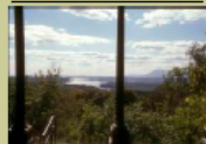
View of the Hudson Valley south, southeast from Ghana