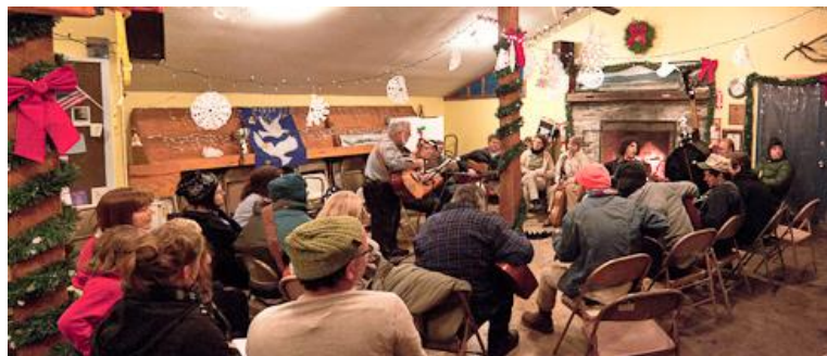
Above: The Sloop Club at meeting time Bottom: a cozy Circle of Song around the fire