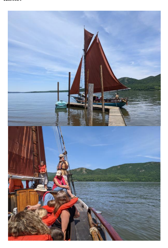
Cornwall