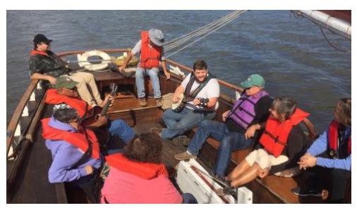
Sloop Club Congress Sail, 2018